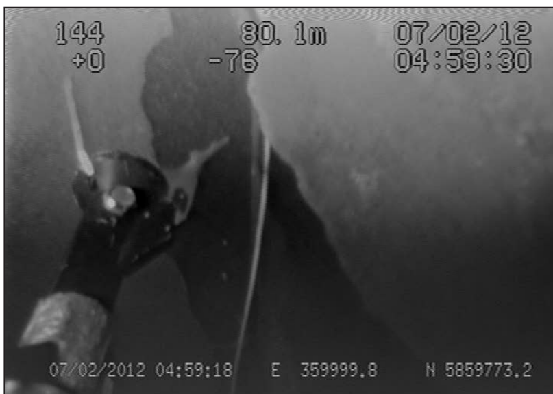
Figure 2: ROV image of the structural failure amidships

On 27 November 2011, the master and five of the crew from the 34-year old general cargo ship Swanland were lost when the vessel foundered about 17 minutes after suffering a structural failure amidships. The failure occurred as the vessel was heading directly into a south westerly gale in rough to very rough seas. Only the second officer and an AB survived. Underwater surveys confirmed that the vessel had suffered a structural failure amidships ( Figure 2 ).