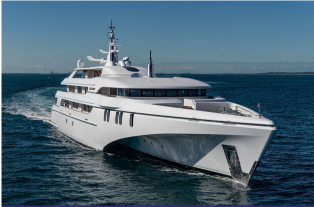
NAME: WHITE RABBIT LENGTH: 84m TYPE: Private Yacht