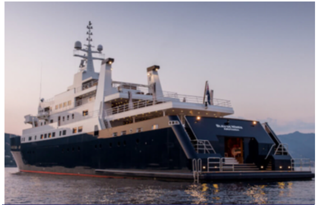
NAME: BLEU DE NIMES LENGTH: 72m TYPE: Dual (Private/Commercial)