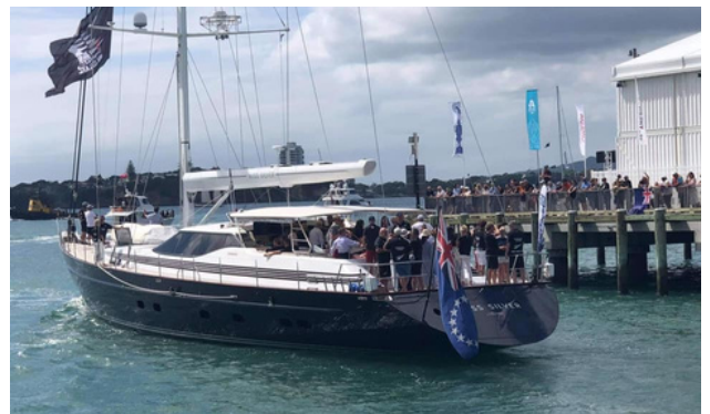
NAME: MISS SILVER LENGTH: 36.12m TYPE: Private Yacht