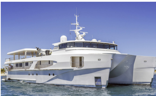
NAME: CHARLEY LENGTH: 42m TYPE: Private Yacht