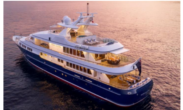
NAME: HERCULES LENGTH: 50m TYPE: Private Yacht