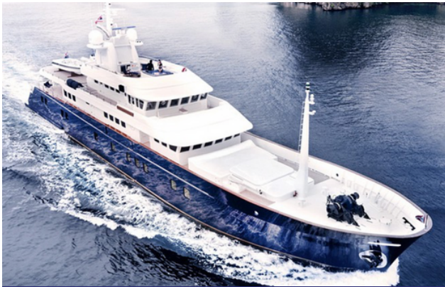
NAME: NORTHERN SUN LENGTH: 50m TYPE: Private Yacht